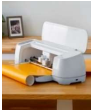
Segment II Cricut Class Intermediate Cost- $25.00