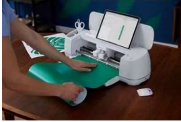
Segment 1 Cricut Class Beginner Cost: $25.00